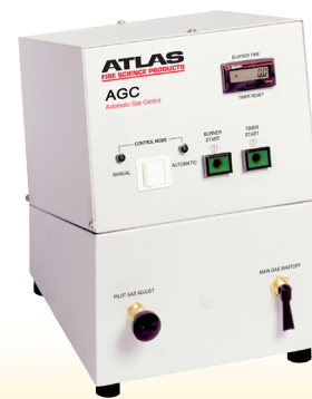
Automatic Gas Control Option

Auto flame impingement and electronic control ensure repeatable test results